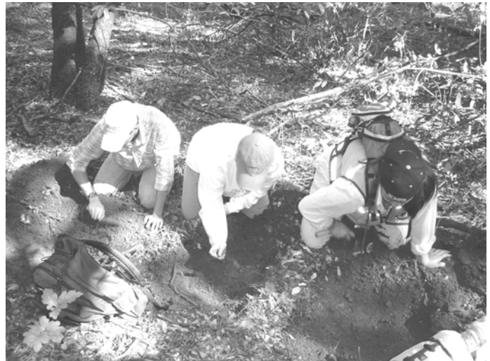
Students doing what they love!