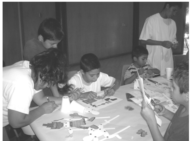
Museum 2007 Summer Camp.